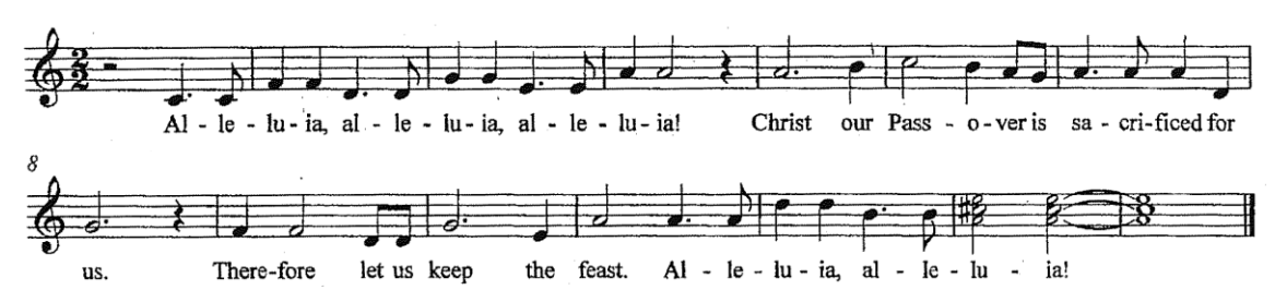
Facing the people, the priest says the following invitation

The Gifts of God for the People of God. Take them in remembrance that Christ died for you, and feed on him in your hearts by faith, with thanksgiving.